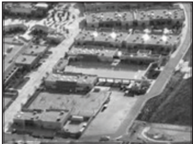
Phase II Complete at Tahquitz High School