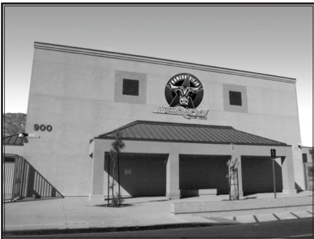
Rancho Viejo Middle School Administration Building