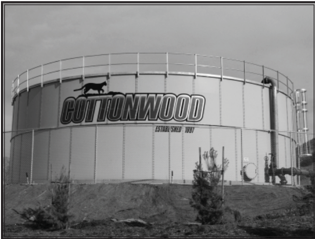
Cottonwood School Water Tank

The Cottonwood Tank was completed and dedicated in August. The 376,000 gallon tank supplies potable water, irrigation and fire protection to the campus. □